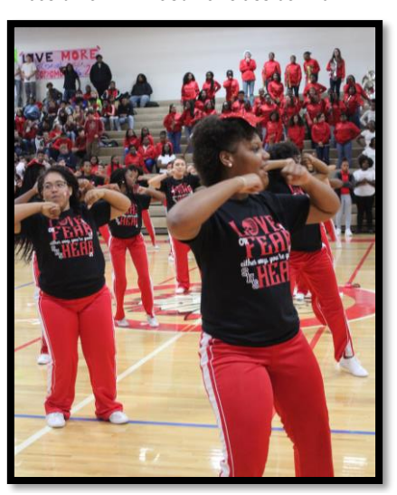
Class of 2019 cheering during the pep rally