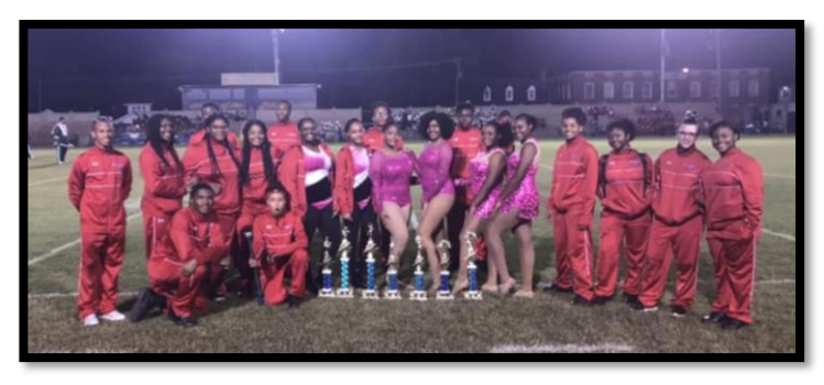
Band Members at the Hopewell Wonder City Classic Competition.