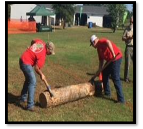
SHS FFA students participate in a State Fair competition