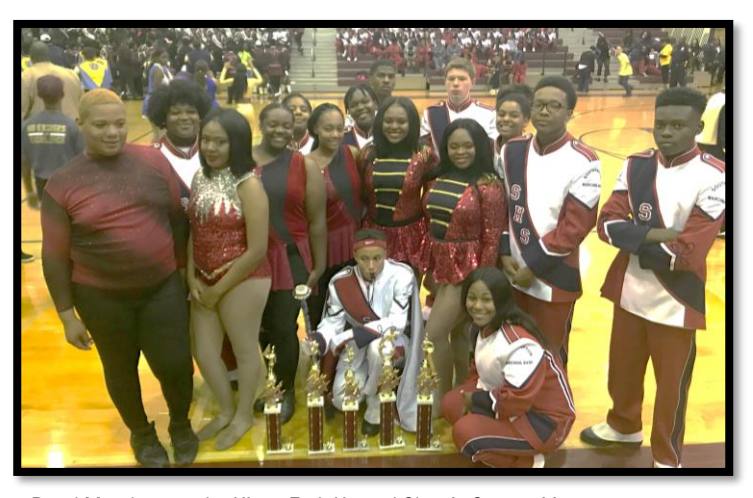
Band Members at the Kings Fork Kennel Classic Competition